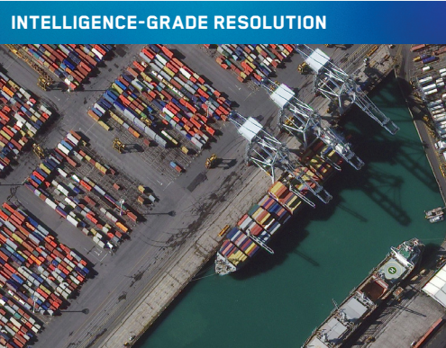
WorldView-3 | 30 cm | Auckland, Australia