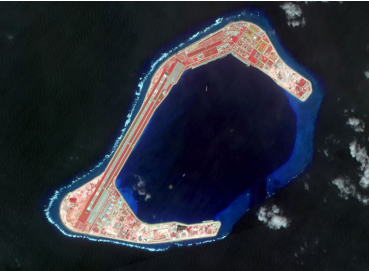
WorldView-3 Pan Sharpened Color Infrared