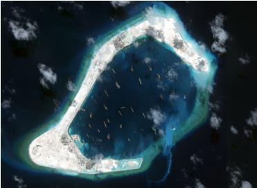
WorldView-3 Pan Sharpened Natural Color