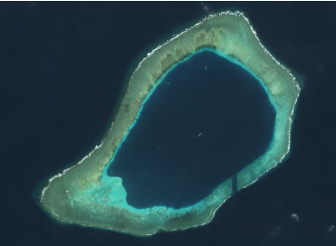
WorldView-2 Pan Sharpened Natural Color