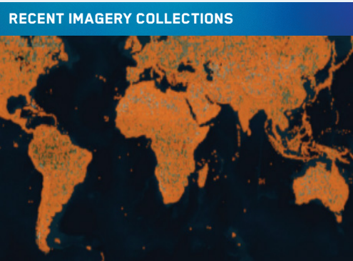
Six months of new imagery collections shown as orange areas